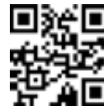
2D Data Matrix Tag