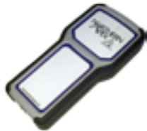
RG 900 INT Reader