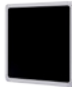
10" Flat Antenna