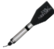
RG Radiant Wand