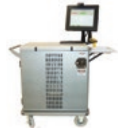
Mobile RFID Station