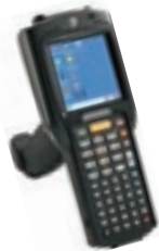
Handheld RFID Reader

Our suite of hardware has been carefully designed to work together seamlessly to provide our customers with optimum performance. A typical system consists of handheld RFID readers, entryway readers, and mobile RFID stations.